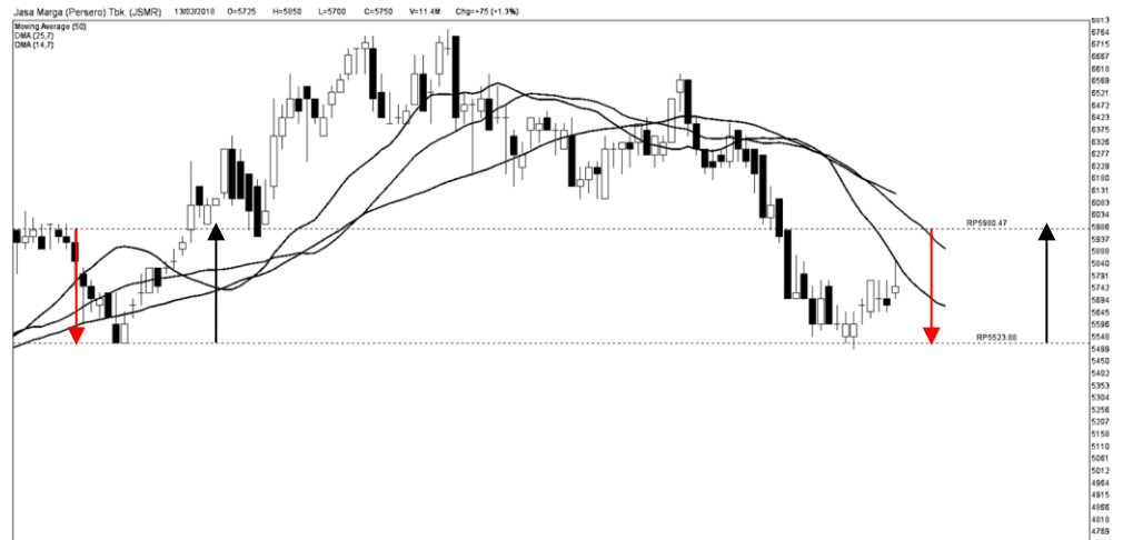
Kinerja saham JSMR

Danareksa research report are also available at Reuters Mulfex and First Call Direct and Bloomberg