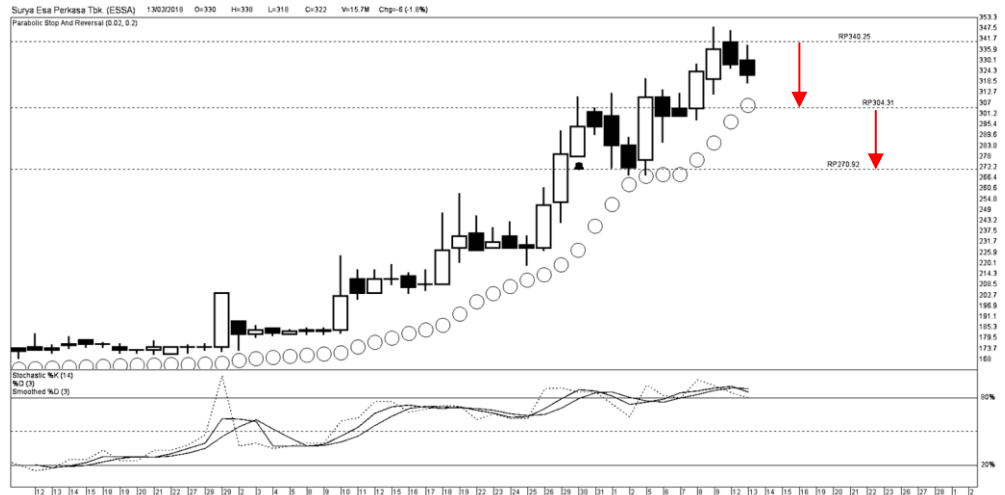
Kinerja saham ESSA

Danareksa research report are also available at Reuters Multex and First Call Direct and Bloomberg