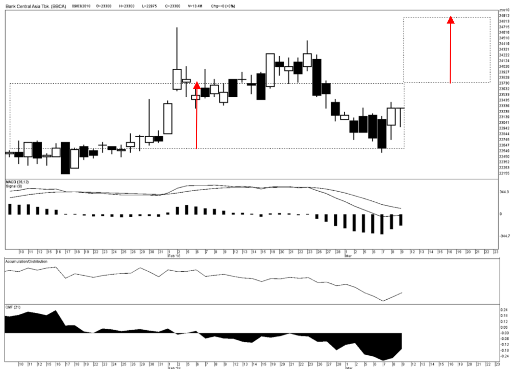
Kinerja saham BBCA