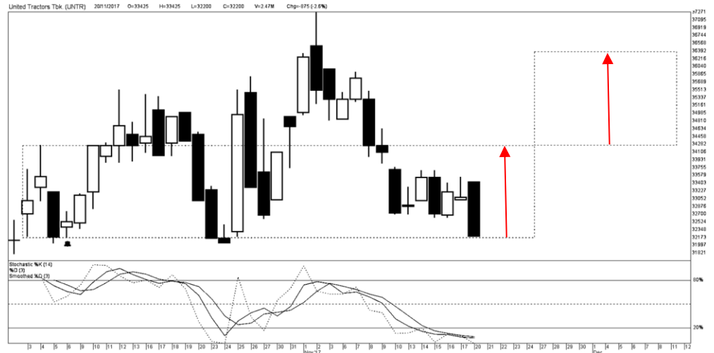
Kinerja saham UNTR

Danareksa research report are also available at Reuters Multex and First Call Direct and Bloomberg