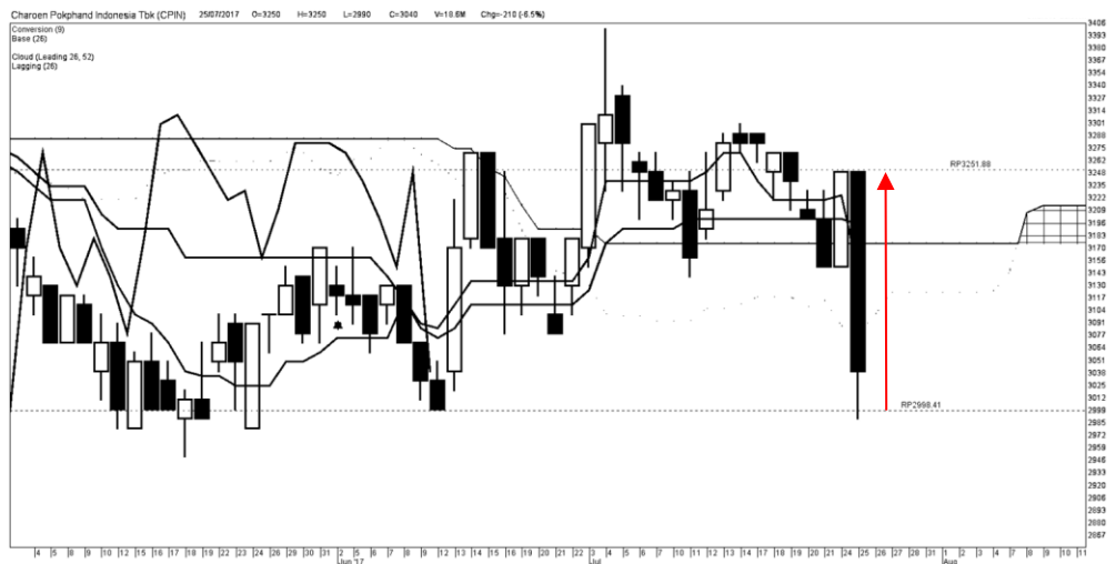
Kinerja saham CPIN