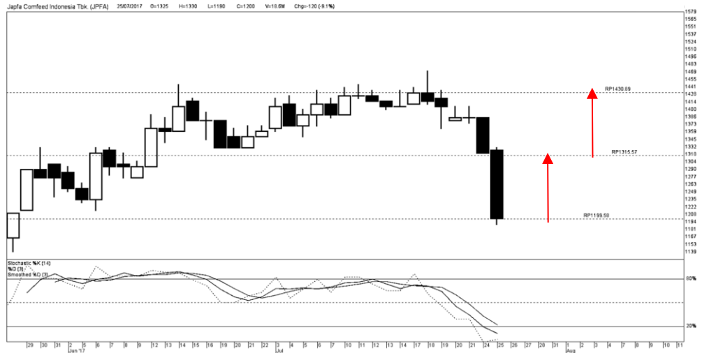
Kinerja saham JPFA

Danareksa research report are also available at Reuters Multex and First Call Direct and Bloomberg