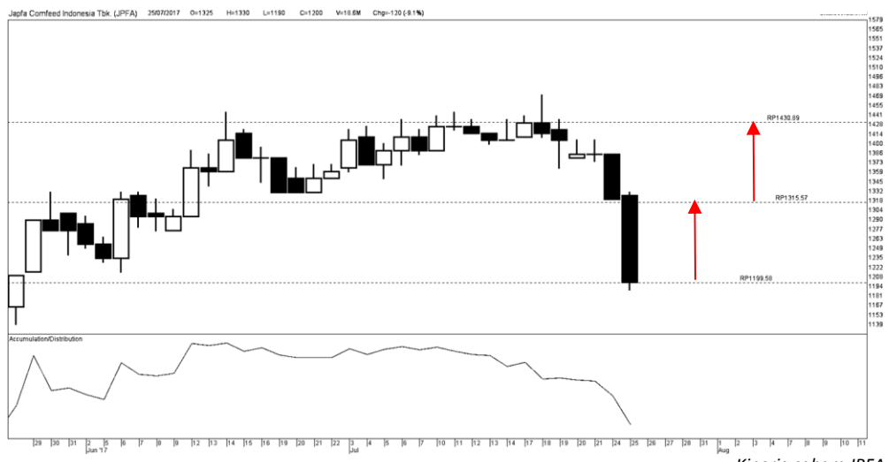
Kinerja saham JPFA