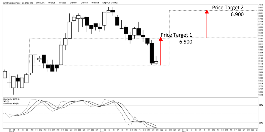
Kinerja saham AKRA

Danareksa research report are also available at Reuters Multex and First Call Direct and Bloomberg