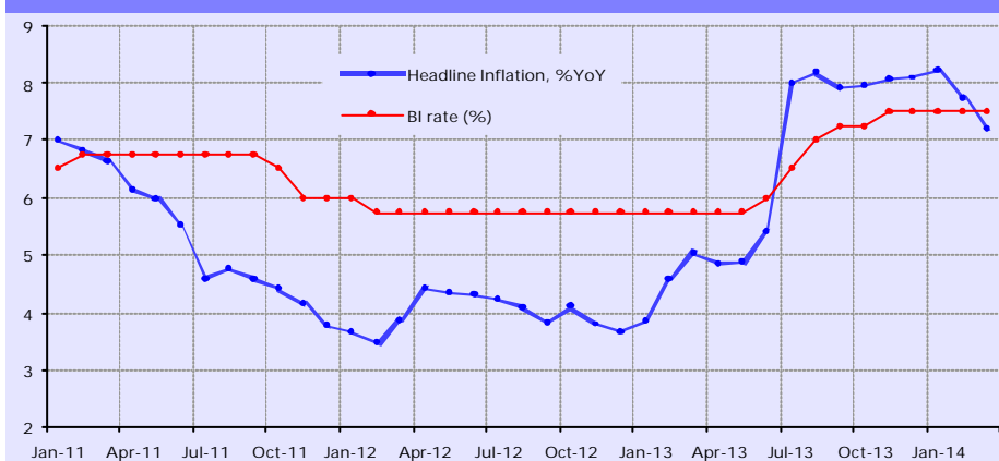
GRAPH 2. THE BI RATE WAS UNCHANGED IN MARCH 2014